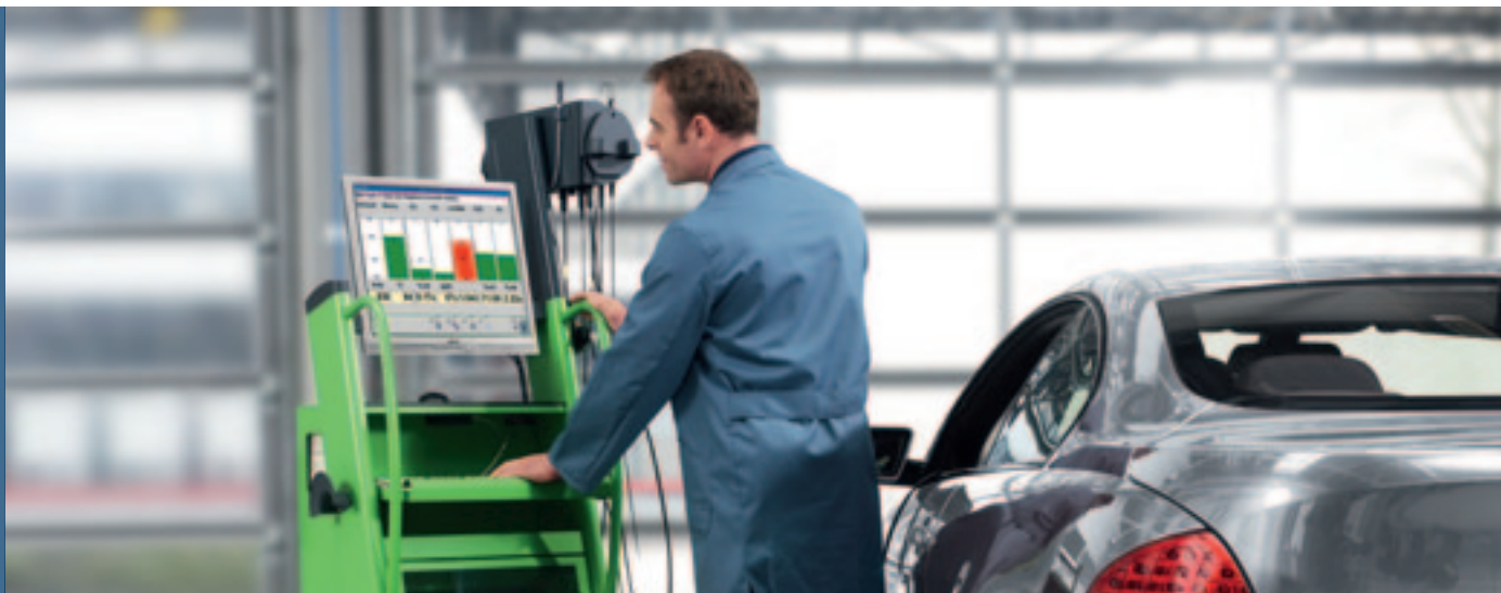
Emission analysis with BEA 850

Testing and minimizing pollutant emissions with modular measurement technology – in accordance with the latest legislation and with highest measurement accuracy. The workshop requires robust, future-proof technology to achieve this, with clear operator guidance and simple handling. The emission analysis instruments from Bosch test equipment excel through their easy and timesaving handling. Other particularly important aspects in the daily handling of exhaust-gas analysers are the short run-up times and brief measuring times.