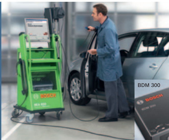
Effective emission analysis of vehicles