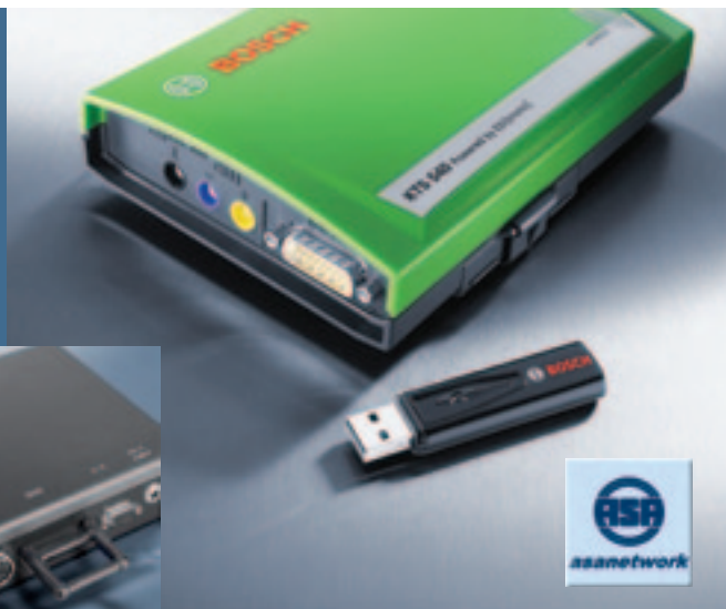
KTS 540 wireless for ECU Diagnosis